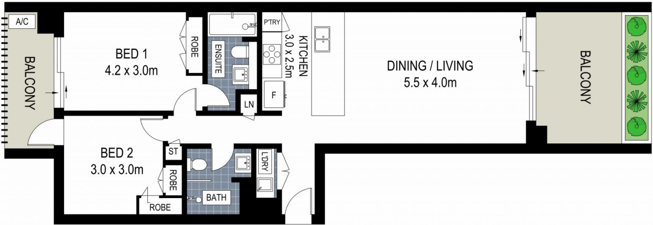
↑ LEVEL TWO