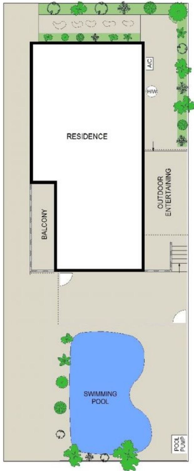
SITE PLAN ( NOT TO SCALE )