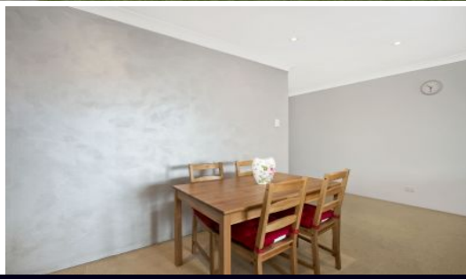
8/88 Woniora Road Hurstville NSW